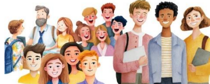
Education Week 2026 Every Child. Every Classroom. Every Day

In the 1/2 Learning Community, parents and carers helped students to complete a shape pattern problem solving activity. Students displayed their new shape knowledge by creating repeating 2D and 3D shape patterns. They then took their parents and carers around the Learning Community to show them all the fantastic work they have completed. Finally, the 1/2 students confidently performed two songs.