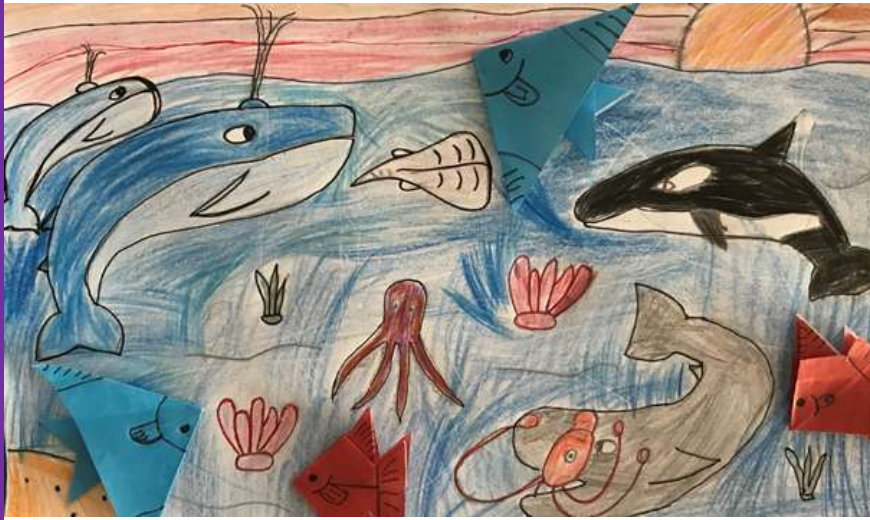
Collage, drawing and playdough pets!