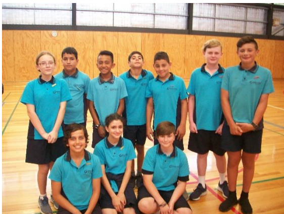
School and House Captains 2019