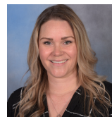
Shonel 5/6 Support Staff