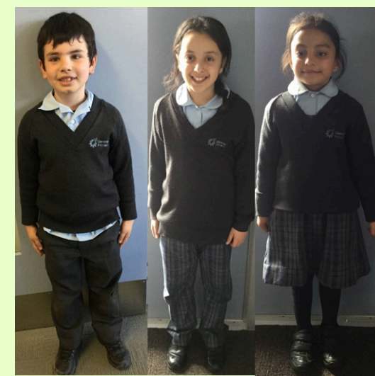
Even weeks: Spelling Test